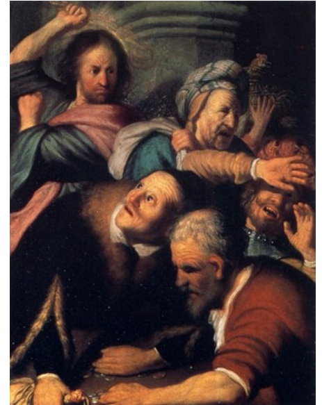
Rembrandt, 1626 Italian